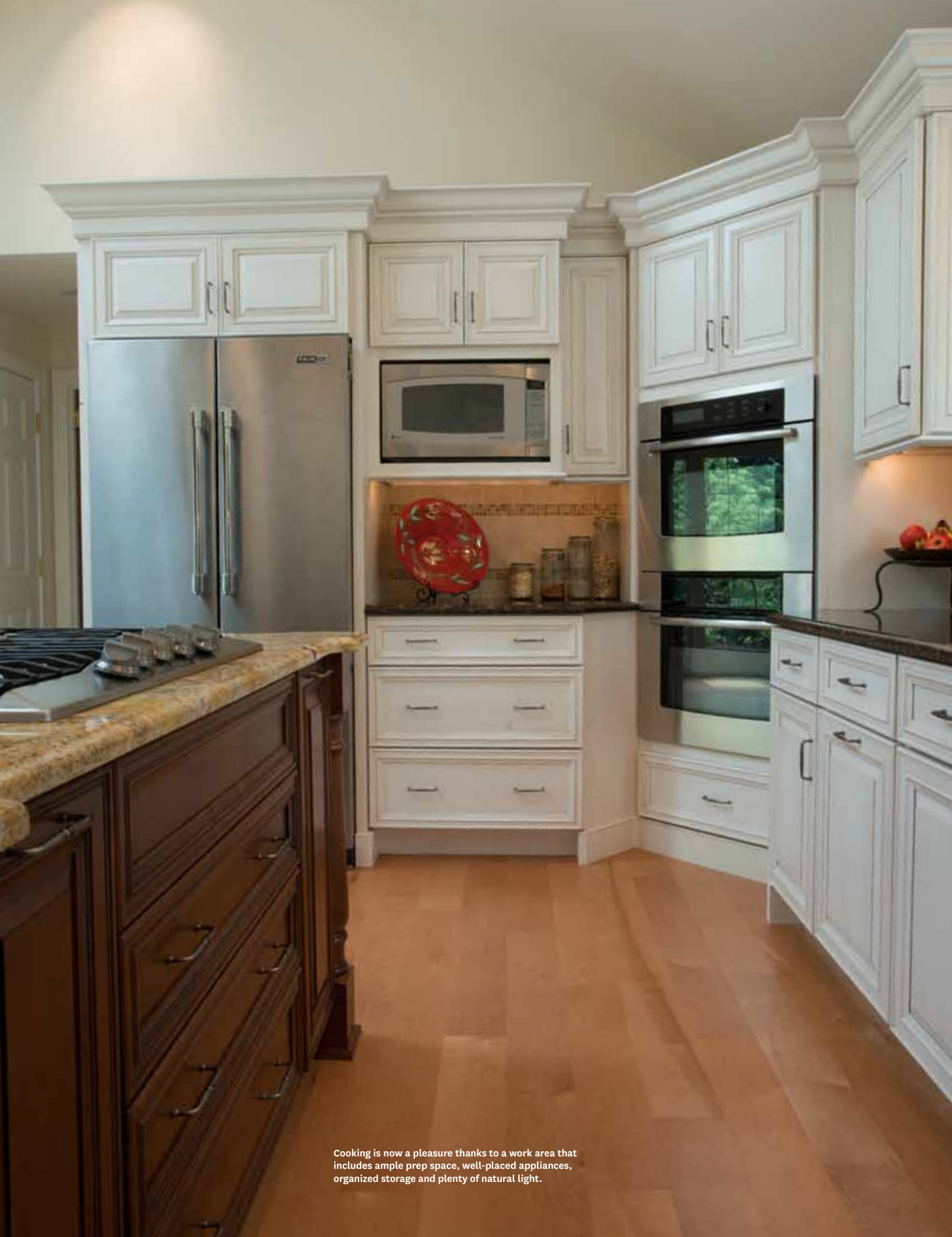
Cooking is now a pleasure thanks to a work area that includes ample prep space, well-placed appliances, organized storage and plenty of natural light.

THE FAMILY OF FOUR purchased their mid-century house three years ago. The neighborhood features classic homes on wooded lots that are a stone's throw from the Conestoga River. The new owners immediately formulated a "to-do" list. The kitchen, which needed some serious work, topped the list. "It was an odd set-up for a house of this size," David says, recalling the first time he saw the small kitchen that was separated from the rest of the house by a laundry room. "The laundry room dominated a large portion of the kitchen space," he says.