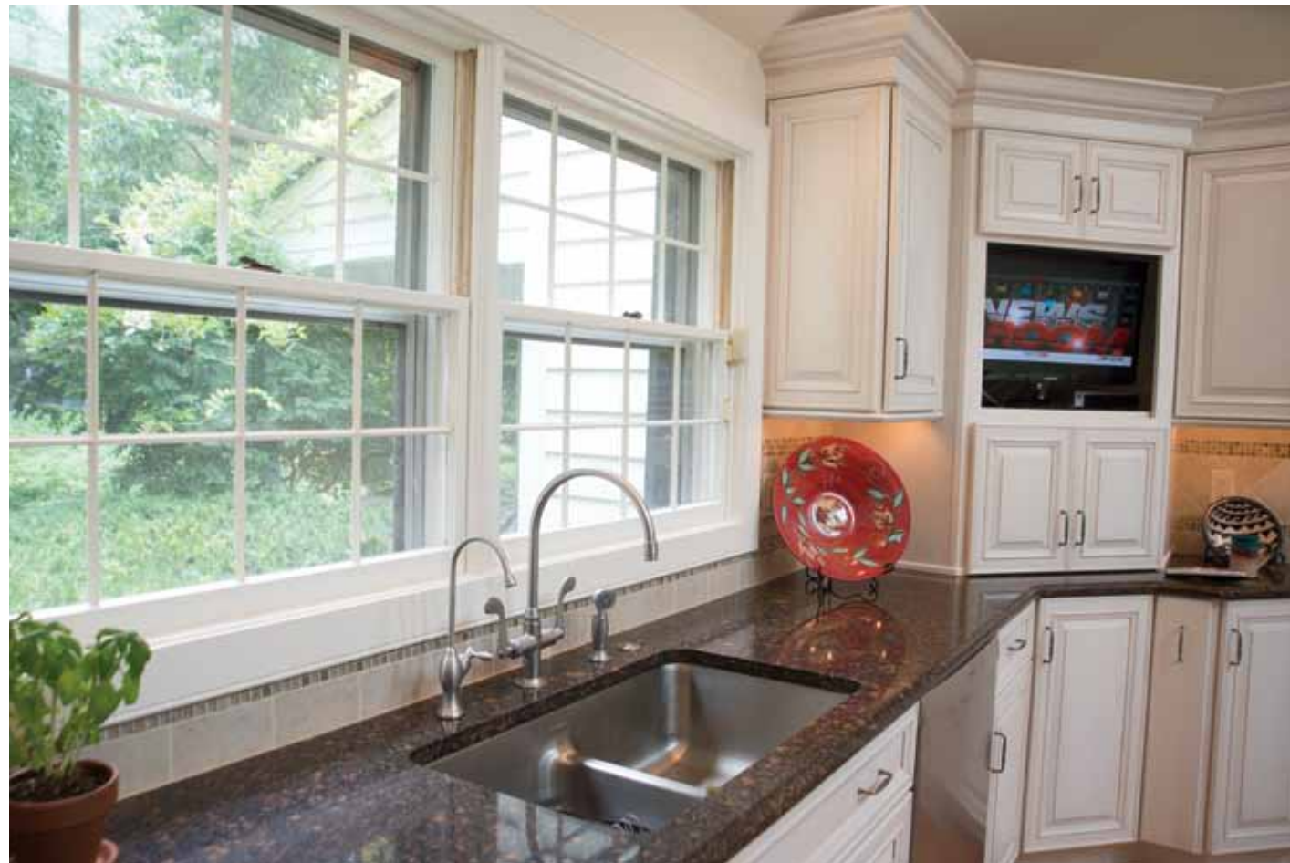
A cut-out provides the kitchen with a mini-sized media center. Quartz tops the counters, while granite covers the island.